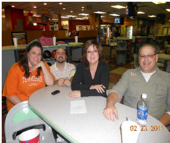
Last Place: Woodard Enterprises