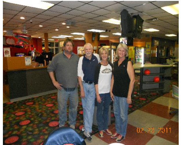
2 nd Place: Barrett Construction & Renovation,